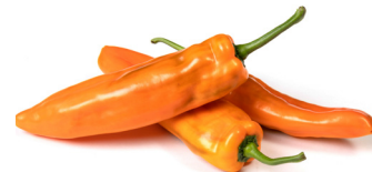
Sweet point pepper orange

C PA18-1774 S 18,0 x 5,0 cm W 100-120 gr B 9-10 R Tm:0