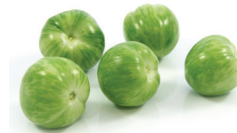
Cocktail tomato tiger green

C T013-406 S 3,5 x 3,5 cm W 35-40 gr B 4-5