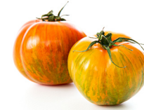
Tiger tomato red

C T012-609 S 6,0 x 6,0 cm W 60-80 gr B 4-6