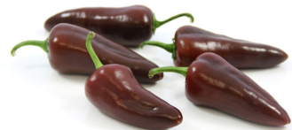
Sweet mini pepper brown

C PA19-2281 S 8,0 x 3,0 cm W 30-35 gr B 10-11 R Tm:0-2