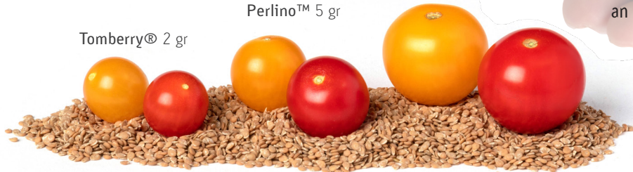
Cherry Yellow 15-20 gr T020-3656