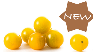
Cherry tomato yellow

C in development S 3,5 x 3,5 cm W 15-20 gr B 8-9