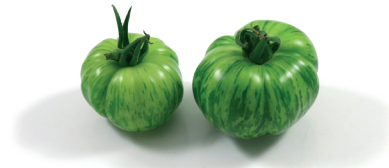
Standard tomato tiger green

C T013-406 S 3,5 x 3,5 cm W 35-40 gr B 4-5