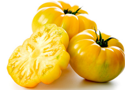
Beef tomato pineapple

C T013-421 S 6,0 x 6,0 cm W 100-110 gr B 7-8