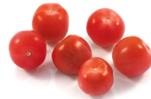
Cherry tomato red

C in development S 3,5 x 3,5 cm W 15-20 gr B 8-9