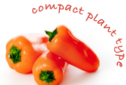
Sweet mini pepper orange

C PA17-1162 S 8,0 x 3,0 cm W 30-35 gr B 10-11 R Tm:0-2