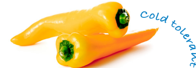
Sweet point pepper yellow

C PA19-1913 S 18,0 x 5,0 cm W 100-120 gr B 9-10 R Tm:0-2