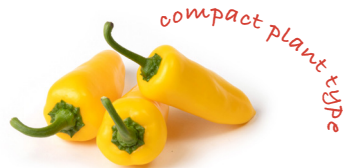
Sweet mini pepper yellow

C PA18-1641 S 8,0 x 3,0 cm W 30-35 gr B 10-11 R Tm:0-2