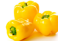
Tinkerbell® mini block yellow

C PA16-214 S 5,0 x 4,0 cm W 30-35 gr B 7-8 R Tm:0-3