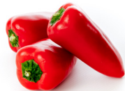
Sweet mini pepper red

C PA18-1641 S 8,0 x 3,0 cm W 30-35 gr B 10-11 R Tm:0-2